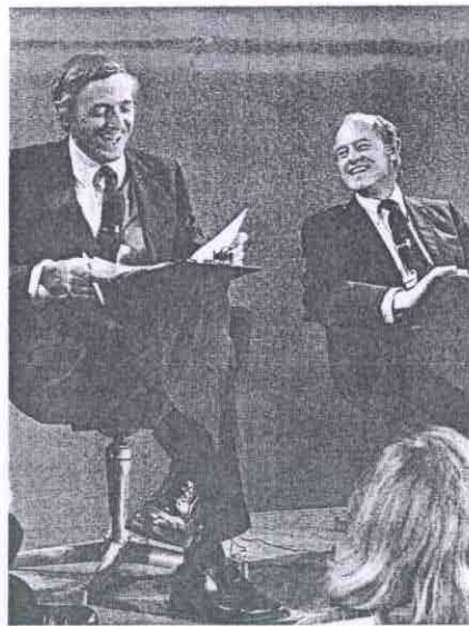
Hunt, right, shares a laugh with William F. Buckley before appearing on Buckley's talk show, "Firing Line," in May 1974. Buckley has been a good friend of Hunt's since their days together in the CIA during the 1950s.

then, Hunt has authored more than 70 well-received spy novels and political capers. His latest— Gulley Knowledge —is a compelling account of sexual and political conspiracy in Washington's highest echelons. The book details how a prominent senator, on the fast track to being the first female president of the United States, is blackmailed by political forces bent on denailing her ascent to the Oval Office. Hunt calls the book, written a year before the Clinton-Lewinsky sex scandal broke, "a political novel of Washington today and tomorrow .... The concept of a female president, whether Mrs. Dole or Mrs. Clinton, is gaining greater currency," he says.